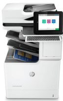
HP Color LaserJet Managed Flow MFP E67560z

HP Managed MFPs are optimized for managed environments. Offering increased monthly page volumes and fewer interventions, this product can help reduce printing and copying costs. See your HP Authorized Reseller for details.