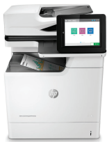
HP Color LaserJet Managed MFP E67550dh

HP Managed MFPs are optimized for managed environments. Offering increased monthly page volumes and fewer interventions, this product can help reduce printing and copying costs. See your HP Authorized Reseller for details.